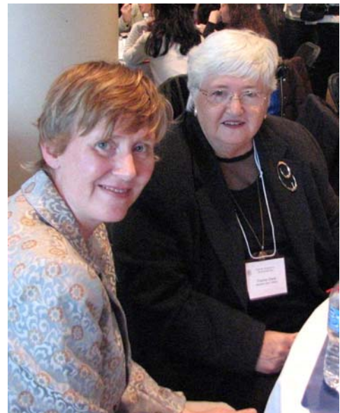
ELSA Net Conference, November 3, 2008

English Language Services for Adults is our name and our policy, and provision of training in the English language is the on-going challenge and reward we all share.