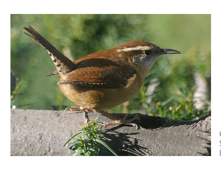
Carolina Wren.

There are 2 main characters in the story you are going to hear: a small brown wren and a large elk. One day, these 2 animals meet on a forest trail. Using this information and the words above, predict what you think might happen in this story. Share your prediction with your partner.