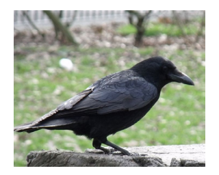
Beaumont Park Crow 1202 3. Photo by C-Hoare for Flikr. Released under CC-by-2.0 (cropped from original)