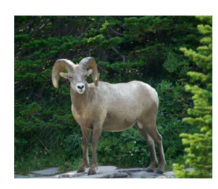
Bighorn Ram. Photo by GlacierNPS for Flikr. Released under CC-by-2.0