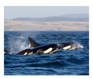
Orca Family.