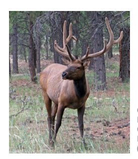
Grand Canyon National Park Bull Elk 0781.