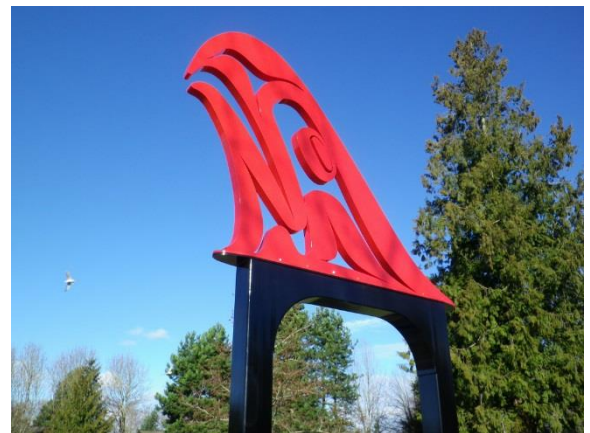
Eagle Calling , Robert Davidson (2014) Located at Frank Hurt Park, Surrey.