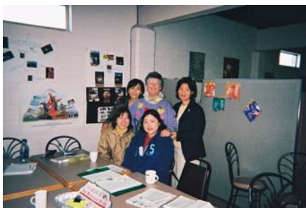
A conversation study group at Chilliwack Community Services