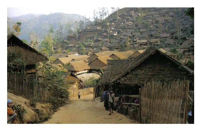
One of the hometowns where the Karen people come from

For more in-depth information on the Karen, contact ISS at 530 Drake Street, Vancouver, 604.684.7498; or <u>settlement@issbc.org</u>, or see: Karen Cultural Profile – a tool for settlement workers and sponsors , IOM Bangkok, 2006.