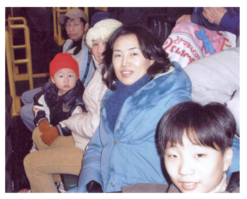
ELSA students and families from New Directions-Langley at a hockey game

Although the Langley Chiefs did not win the game, we all had a blast and it was a great introduction to ice hockey in Canada! The greatest surprise was seeing a couple from Colombia that had graduated three years